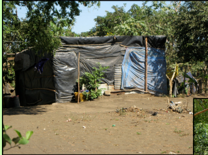
You can help a family move from a home like the one pictured above to a new home like the one pictured below. That's the difference that YOU can make.